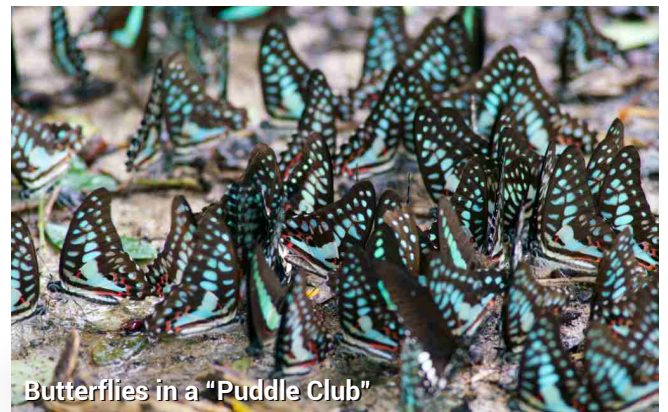
Butterflies in a "Puddle Club"